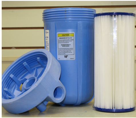
Figure 2. Whole-house filter housing with a pleated filter.