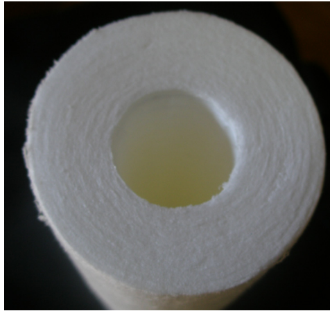
Figure 4. Close-up of a spun-polypropylene filter.

Sediment filters typically look like woven string (Figure 1), pleated paper (Figure 2) or spun polypropylene (Figure 3 and close-up Figure 4) are selected based on the particle size removed (for example, 2 microns to 100 microns). A small particle size (2- to 5-micron) filter has smaller pores and thus requires more pressure to push the water through the filtering material.