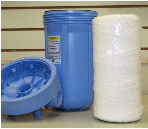
Figure 1. Whole-house filter housing with woven-string filter.