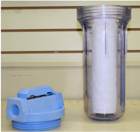
Figure 3. Clear whole-house filter housing allows you to see when filter is plugged.