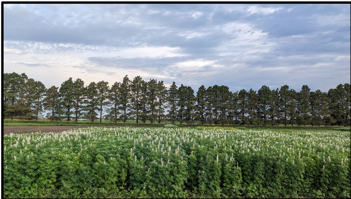
Advanced breeding line selections of sweet white lupin.

No commercial sweet white lupin varieties are well adapted to North Dakota. To address this gap, the CREC has been screening germplasm, making selections and advancing breeding lines. Lines were evaluated primarily for maturity date, yield, seed size and sweetness. In 2022, fourteen preliminary lines underwent variety trials. Variety trials were planted in Carrington, Dickinson, Hettinger, Langdon, Minot, and Williston. Each trial consisted of three to four replicated plots arranged in a randomized complete block design.