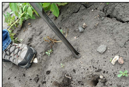
Standard soil probe.

Estimate the soil water deficit using the “Feel Method” outlined in Table 5. Soil samples should be taken in 6-inch increments to the depth used for water management (Table 2). Brochures with pictures showing the feel method for various soil textures can be found on the internet by doing a search using “soil water by the feel method” or go to the website listed in the section titled Additional Irrigation Scheduling Resources for North Dakota.