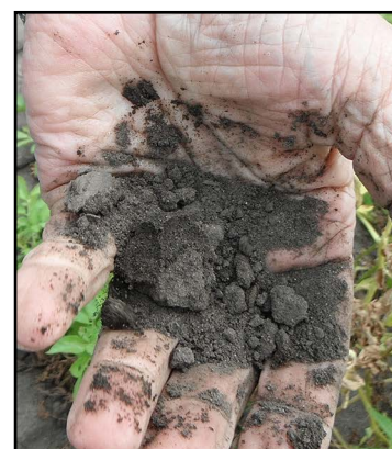
Dry soil with less than 50% of available water.