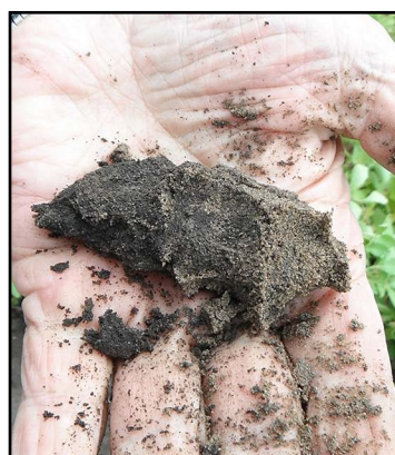
Wet soil that forms a tight ball and indicates more than 75% available water. (Tom Scherer, NDSU)