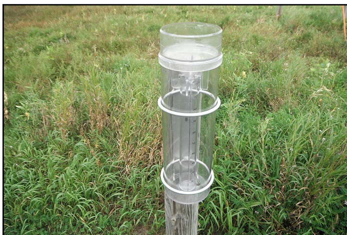
Standard 4-inch-diameter National Weather Service rain gauge

To use the balance sheet, enter the estimated water use and add this to the previous day’s soil water deficit. For the first day after emergence, enter the estimated deficit from the field measurements. Subtract rain and/or irrigation for that day and record the new soil water deficit amount.