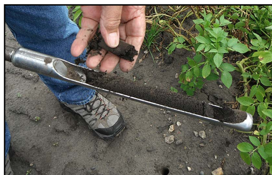
Testing soil moisture in the top 6 inches with a soil probe.