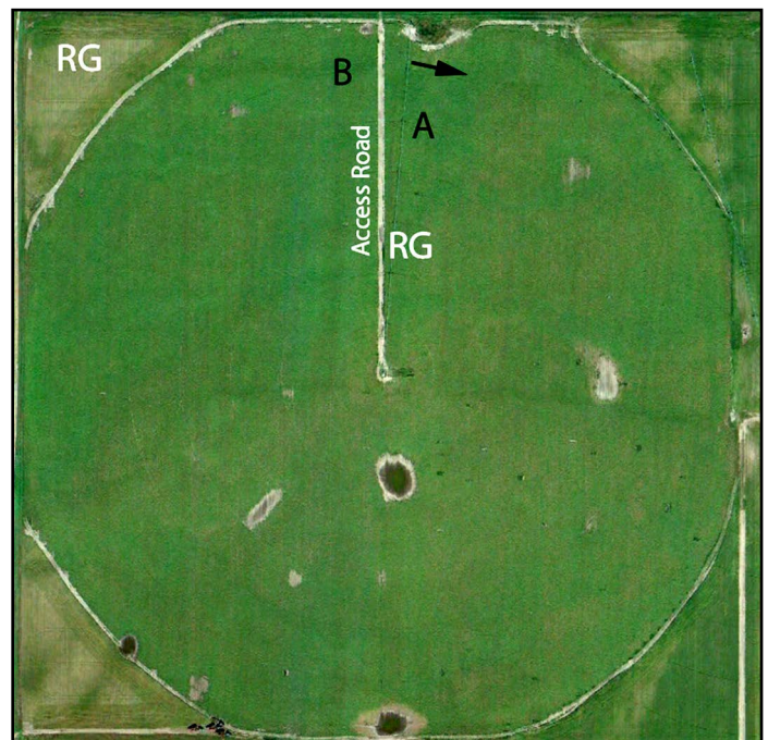
Figure 2. Ideally, each center pivot should have two rain gauges, one in the dryland corner and one along the access road about halfway to the pivot point. Soil moisture deficit should be measured near the starting point of the center pivot (A) and near the last part of the field to be irrigated (B).

The rain gauges should be at least 3 inches in diameter for accuracy. The standard 4-inch-diameter National Weather Service rain gauge that records rain events to 0.01 inch is highly recommended.