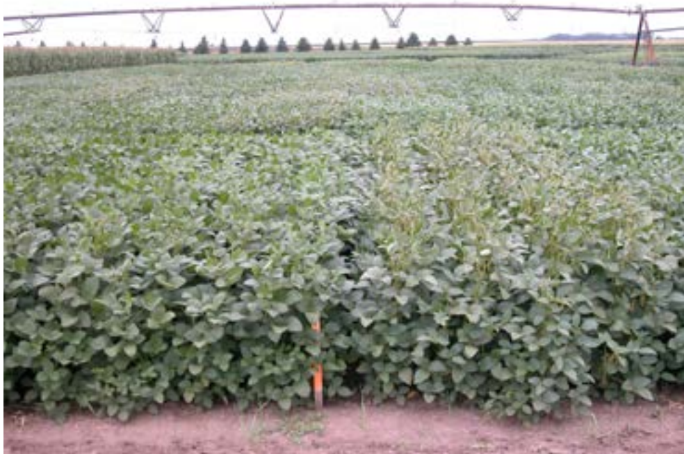
Fourteen-inch rows and two varieties, Carrington, during year two of the study.

Soybean yield was 2.6 bu/acre (5 percent) greater with the later maturity group (50.5 bu/acre), compared with the early maturity group (47.9 bu/acre). The highest