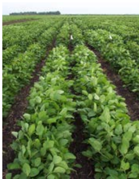
14-inch rows (left) and 28-inch rows (right) at 150,000 pls/A in late July during the second year at Prosper.

Soybean yield and net revenue after costs of research factors with the combination of row spacing, planting rates and special foliar inputs are listed in Table 7 . The highest yield was obtained with foliar inputs in 14-inch