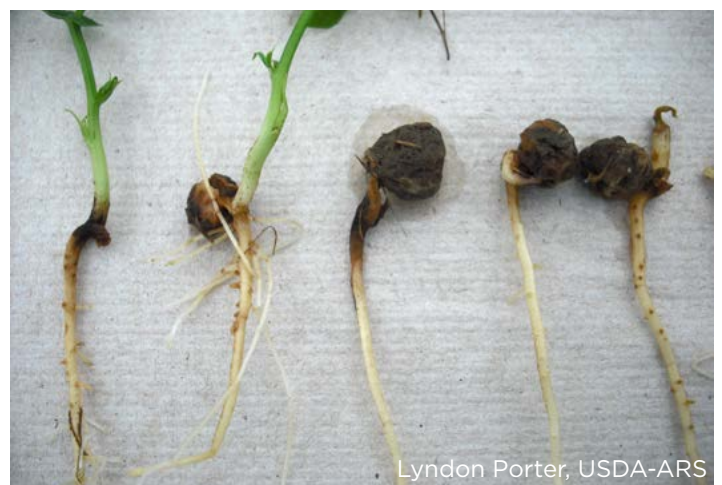
Figure 7. Pythium damping off and seed rot in pea.