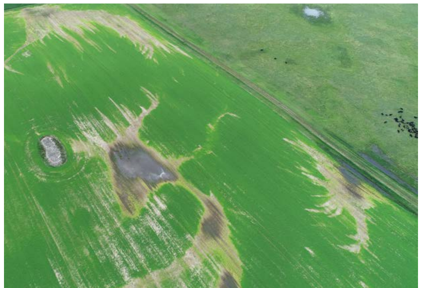
Figure 1. Symptoms associated with low-lying and water-logged areas in a producer field.

Below-ground symptoms include a greatly reduced root system and root discoloration (golden brown to black). Above-ground symptoms include yellowing of the leaves, wilting, stunting and reduced yield. Nodulation also frequently is reduced, causing nutrient deficiencies. Above-ground symptoms (and yield loss) typically appear more severe in areas of the field where plants are stressed from too much or too little water, heavy or compacted soils or nutrient deficiency ( Figure 1 ).