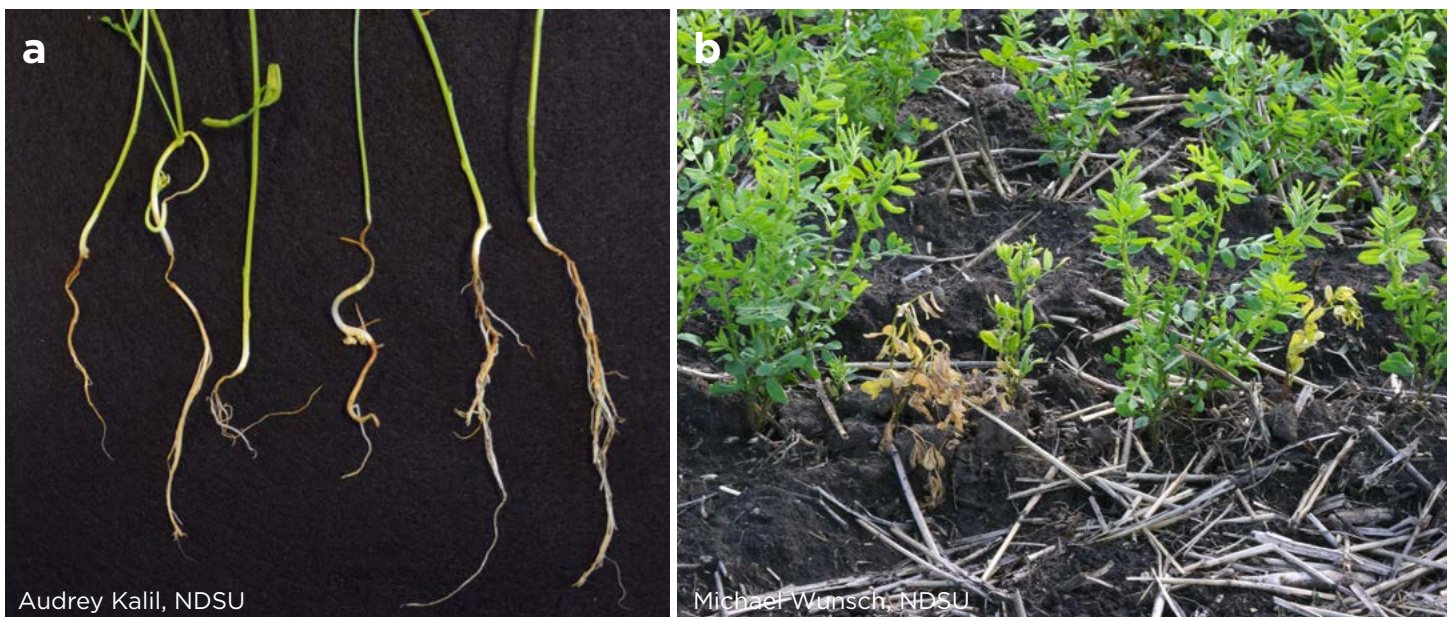
Figure 4. Symptoms of Aphanomyces root rot in lentils: a) roots and b) above-ground.

When environmental conditions are conducive to disease, Aphanomyces root rot is a very serious root disease of peas and lentils. At present, no resistant varieties are available and the oospores can remain viable in the soil for a decade or more. Seed treatment options also are very limited and provide only partial disease suppression.