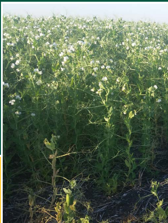
Figure 8. Images are from the same field where one half (top) had one less year of peas than the other half (bottom). The half-field where root rot is severe was seeded to peas in a very wet spring.

Legume crops such as chickpeas, faba beans and soybeans are much less susceptible to Aphanomyces euteiches and could replace peas or lentils in a rotation. Growers also may increase the number of cereal and oilseed crops in between planting peas and lentils.