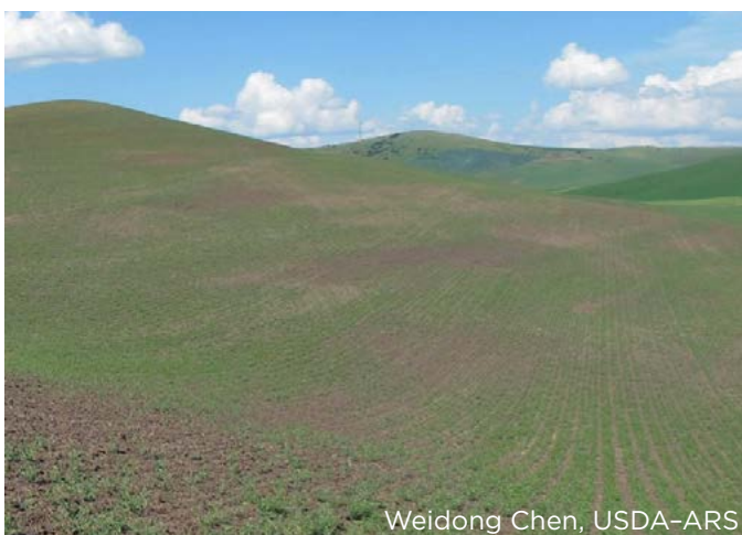
Figure 6. Large areas of poor emergence due to seed rot and damping off caused by Pythium spp.

Infection is favored by cold, wet soils (soil temperatures between 50 and 75 F). The risk of losses to Pythium root rot is highest when soils are saturated for one or more days after planting and before emergence. Like Aphanomyces , Pythium can produce long-lived oospores that reside in the soil.