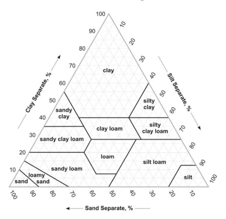
Figure 1. Sand, silt and clay in different soil textures.

The development of soils usually is continuous. Soils constantly are changing in development due to five soil-forming processes: vegetation, topography (landscape structure), parent material, climate and time.