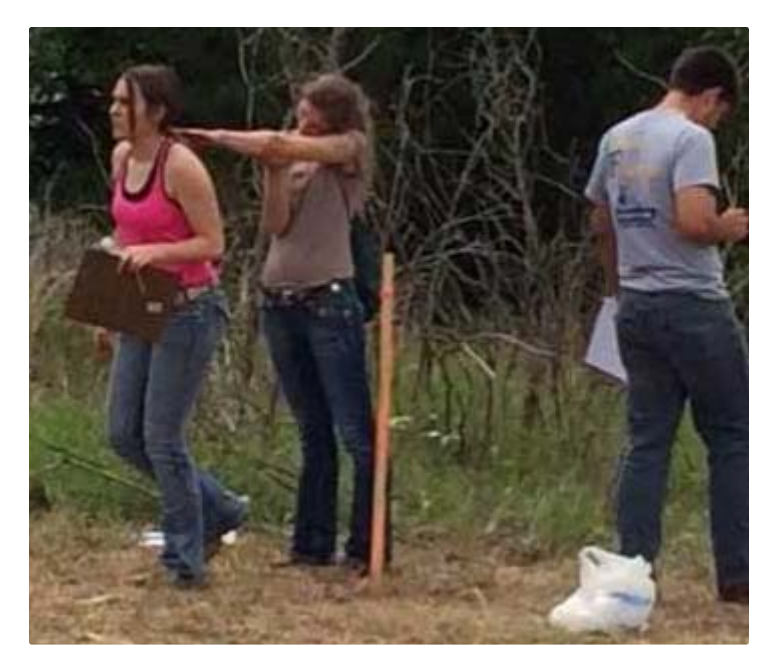
Figure 4. Contestants determining slope.