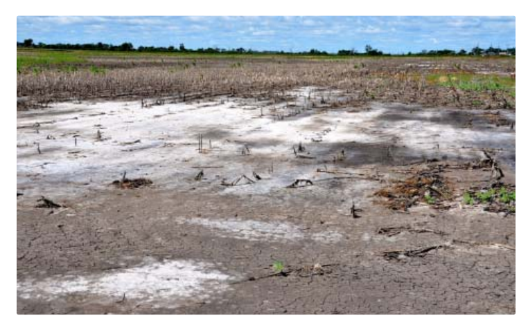
Figure 5. Salt-affected soil with indicator plants and surface whiteness.

In the contest, salts in the topsoil and subsoil count toward the presence of soluble salts. Look around the contest-staked area for indicator plants. These plants,