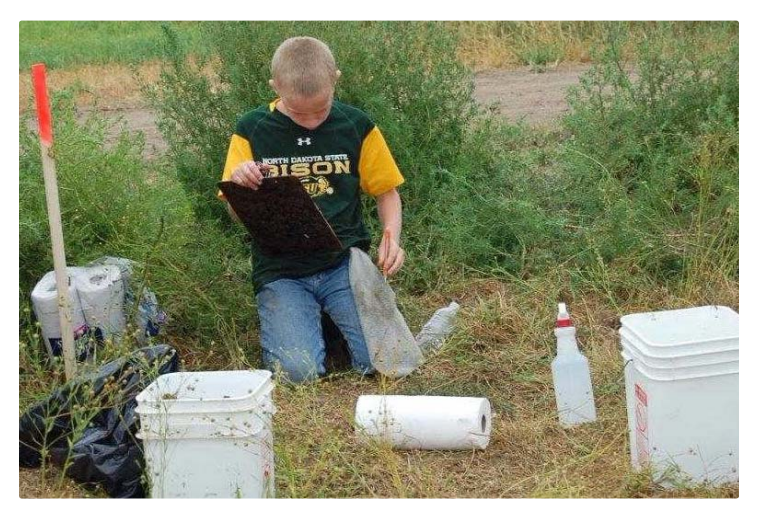
Figure 3. Contestant determines textures.

Take about 1 tablespoon of soil and wet by adding water in small amounts (don't drown it!). Knead it with your fingers in one hand until the soil is plasticlike and moldable (if possible) like moist putty.