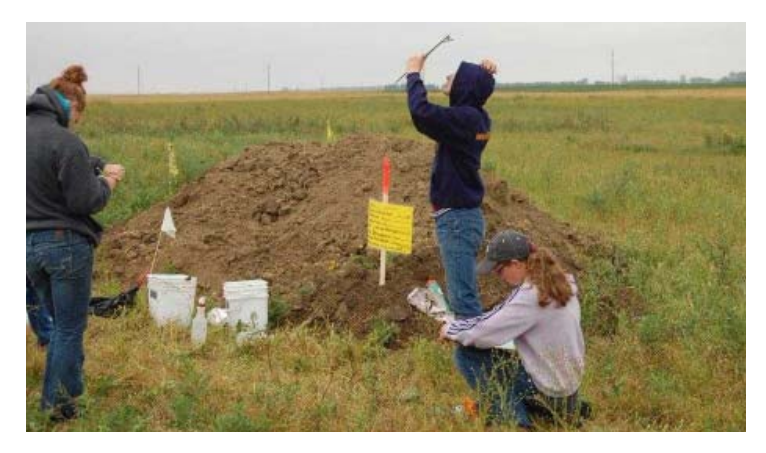
Practice pit

The "field area" around each pit should be marked with flags or stakes and should be at least 100 feet by 100 feet, but it need not be square. Two especially well-marked stakes should be set 100 feet apart for use in estimating slope. Judges will determine slope exactly using a transect or another measurable, repeatable method and will record the slope in the official score card area. Before leaving the area, judges must fill out the official score card completely for each site.