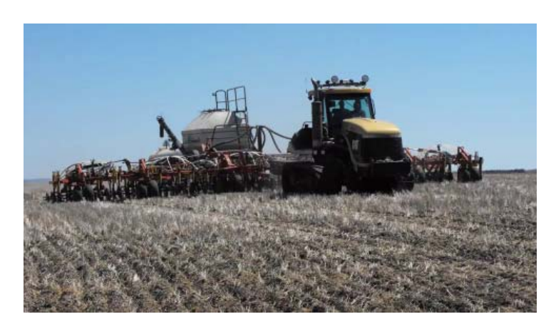
No till

Soils in Class VI have severe limitations, such as steep slopes, severe erosion, shallow soils and rockiness. They are unsuitable for cultivation and their use is limited to pasture, range, woodland or wildlife habitat.