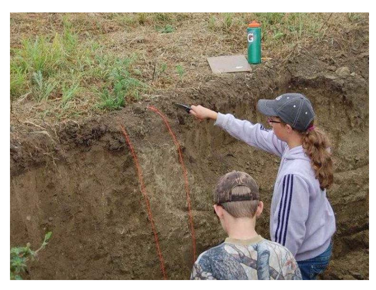
A "no-touch" zone described in a pit.

Provide a five-minute interval for travel between sites. Group 1 then goes to site 2. Group 2 goes to site 3, Group 3 goes to site 4 and Group 4 goes to site 1. This round-robin continues until each group has judged all four sites.