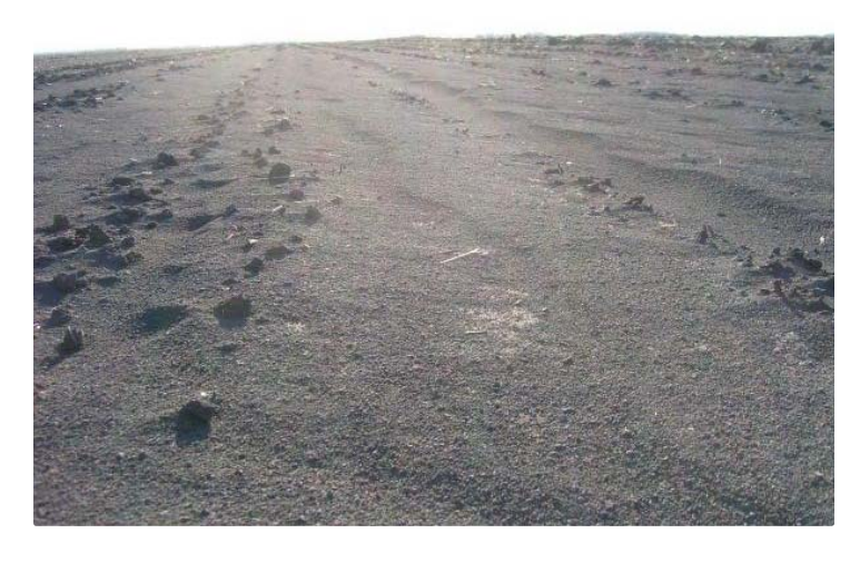
Figure 6. Smoothing of soil after a dust storm in the Red River Valley due to soil movement and soil loss.