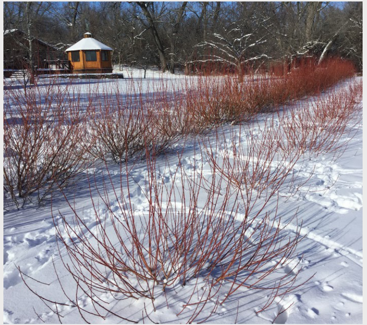
The red color of Flame Willow ( Salix alba 'Flame') stands out in the snow near Kindred, attracting attention and deer.

The American arborvitae Thuja occidentalis comes in varieties of different shapes and sizes including the highly recommended Siberian 'Wareana,' the globe-shaped 'Globosa,' the small 'Hertz Midget' and the popular 'Techny.'