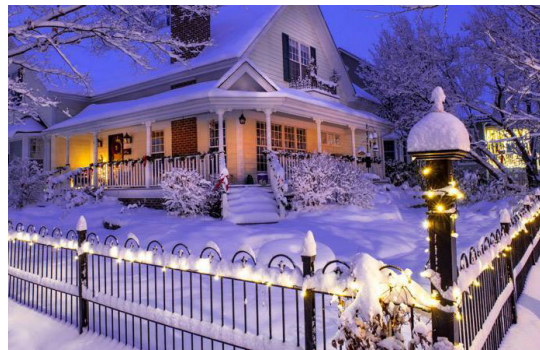
Snow covered lights and fencing create a magical winter garden. (Timeline photo, used with permission.)

Some years, perennial seed heads and grasses can be flattened by the snow, but other years the ethereal seed heads and pods, many surrounded by bronze leaves, lend a special beauty to the