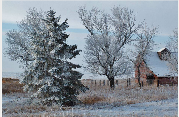
Colorado spruce ( Picea pungens ) is elegantly draped in snow near Mohall.