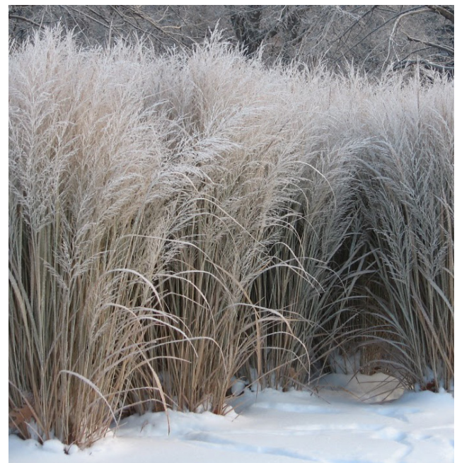
The airy seedheads and blades of Panicum virgatum 'Northwind' bring movement and lightness to a winter garden.