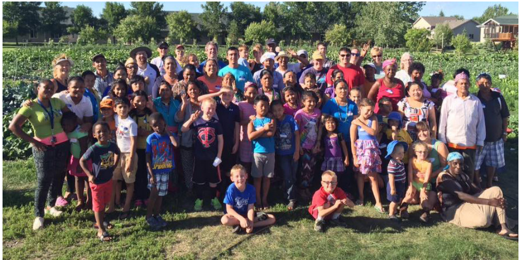
Growing Together gardeners at The Gathering garden.

The group put together a community garden tool kit that outlines everything you need to know in starting a garden, including seasons, tools, harvesting, clean up, and even seed