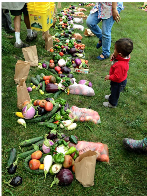
A little boy looks over shares of the harvest lined up for distribution at the Enterprise garden in Fargo.