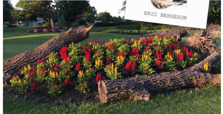
Fig. 1 Logs Afire with Celosia

Few books available today include all these subjects. However, Bergeson is the first to admit his book is not comprehensive. In depth information can be readily accessed online through NDSU, the University of Minnesota and your county extension service.