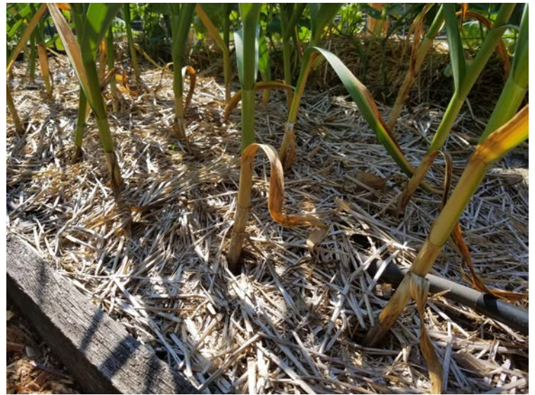
Fig. 4

rows 9 to 12 inches apart and at least 6 inches between cloves. Cover cloves with soil and mulch deeply with 4 to 6 inches of straw, hay or shredded leaves. The mulch protects the garlic from frost heaving and weed competition. In spring (April or May), remove the mulch leaving 1 to 2 inches for moisture retention and weed prevention. If you choose to leave the deep mulch on, free up any shoots that can't pierce the mulch mat.