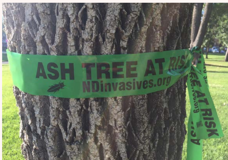
Fig. 2 More information about the emerald ash borer and other invasive pests can be found at www.NDinvasives.org .

The most commonly used insecticide, especially for homeowners, is a solution with imidacloprid. Zeleznik said this insecticide is available in several different formulations. It's been able to control in individual trees, but has to be reapplied every year. Another insecticide, emamectin benzoate, can kill 99 percent of the bugs and has a two-year residual, but is only available by injection by professionals, he said. Officials don't recommend treating trees until EAB has been discovered with 15 miles of a tree.