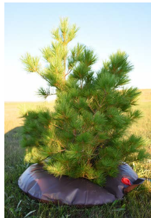
Fig. 2 & 3: Tree bags trickle water to the roots over several hours or more.