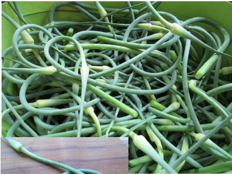
Fig. 2 and 3