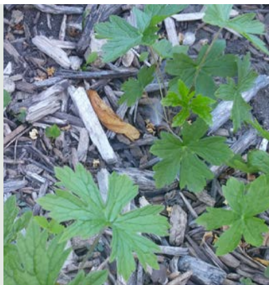
Fig. 2 Wild Geranium

There have also been a few pleasant surprises in the garden. At the end of the 2016 planting season, only one of her wild geranium ( Geranium maculatum ) seedlings had survived. She direct seeded her remaining seeds and Rena now has several Wild Geraniums