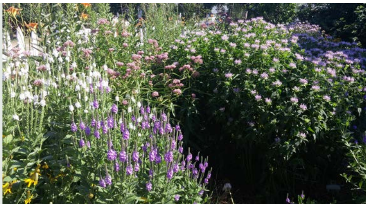
Fig. 3 Pollinator forage abounds in the native garden

Rena reported only a few disappointments in the garden. She has still been unsuccessful with starting the scarlet globemallow ( Sphaeralcea coccinea ), despite indoor and outdoor planting attempts. And one of her long-headed coneflowers ( Ratibida