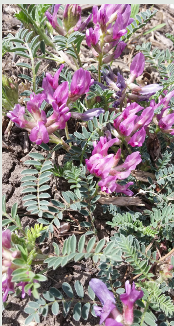
Fig. 4 Ground plum flourishes in drought conditions