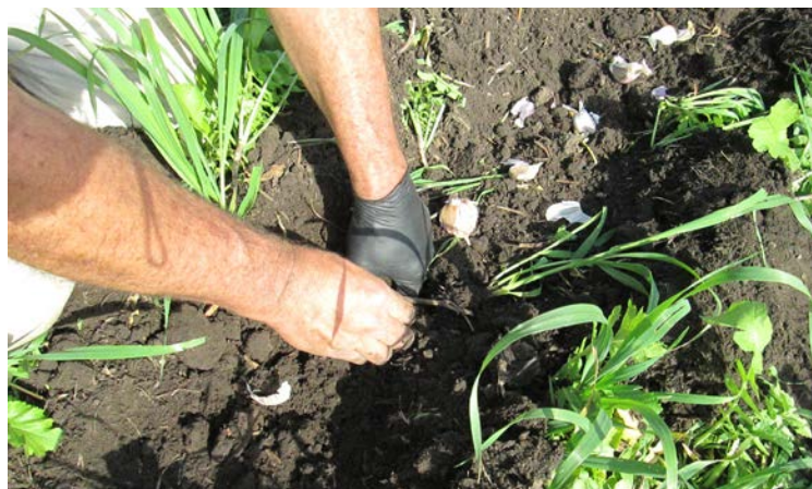
Fig. 1

Plants include the annual Joseph's Coat, Amaranthus tricolor and the sage with both ornamental and culinary properties, Salvia officinalis 'Tricolor'.