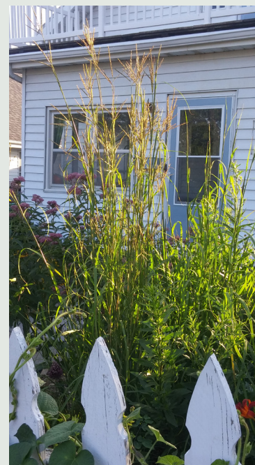
Fig. 5 Indian Grass

columnifera ) has a bit of powdery mildew.