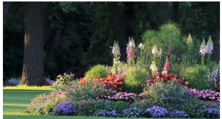
Fig. 2 Flower bed featuring Big Tut grass

This manual is intended for gardeners on the plains of western Minnesota, eastern South Dakota, North Dakota and southern Manitoba. I asked Eric if the information is applicable for the Missouri Plateau and Drift Prairie west of the Red River Valley and the Great Plains area in southwestern North Dakota. Most of the information is applicable to all areas. He replied that he is aware that there are water shortages in western North Dakota and the chapter on watering is more relevant to areas without shortages. On the positive side, these drier areas may see less disease present particularly in spruce.