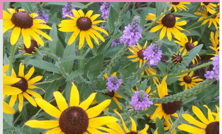
Fig. 1 Black-eyed Susan and purple hoary vervain

Nearly all of her plants came back this spring. The few exceptions included a couple of black-eyed susans ( Rudbeckia hirta ). The surviving black-eyed susans, along with white and purple hoary vervain ( Verbena stricta ) and showy goldenrod ( Solidago speciosa ) have proven to be very successful (Fig. 1). "I had so many of these