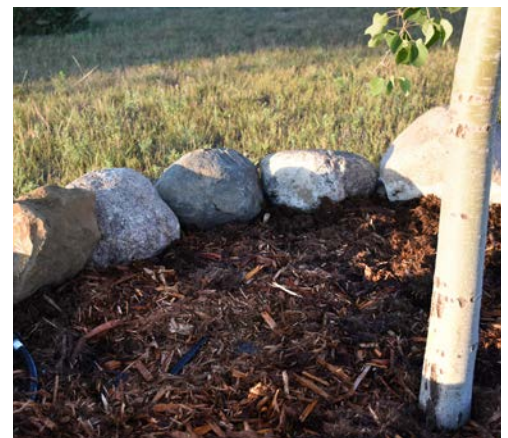
Fig. 1: Mulch over soaker hoses to minimize evaporation.

Trees and woody shrubs have been showing signs of drought stress. Leaves are turning to their autumn colors with increased susceptibility to diseases and pests. While small rain showers may green up the landscape, the subsoil moisture is still very dry. Established trees with extensive root systems generally can make it through a