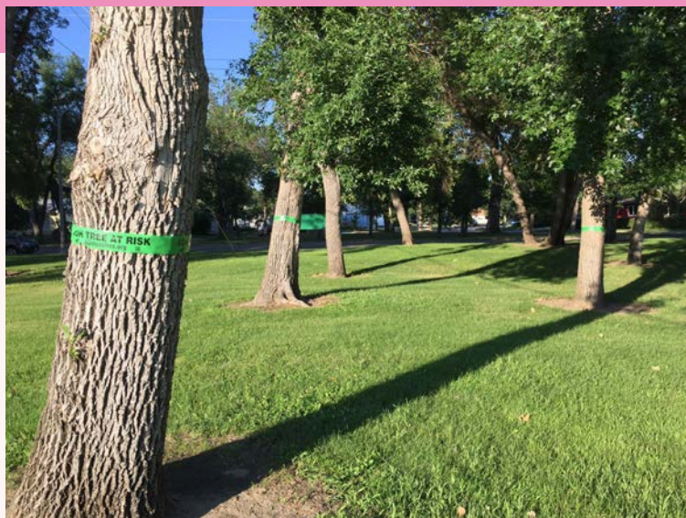
Fig. 1 Plastic ribbons like these are showing up in urban landscapes throughout North Dakota to raise awareness of the emerald ash borer and the devastating effect it could have on trees in the state.

Research into countering EAB is ongoing. Zeleznik said the insect has proven to be cold hardy, even in the frozen winters of the upper midwest where a small percentage of the bugs can survive. While -40 degree temps may keep the riffraff out, it doesn't kill off EAB. "The really cold winters will knock back the population, but it's not going to kill every single insect," Zeleznik said.