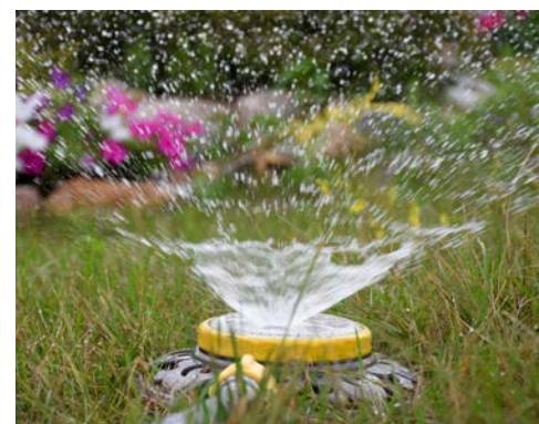
Fig. 4: Water lawns deeply and infrequently.

Drought...when Mother Nature is not so generous, there is a delicate balance between supplementing to provide a sea of lush greenery and a manicured oasis, or fainting at a breath-taking water bill. These tips and advice should help bring North Dakota gardens and its treasures back for another dance next spring, without breaking the bank in the process.