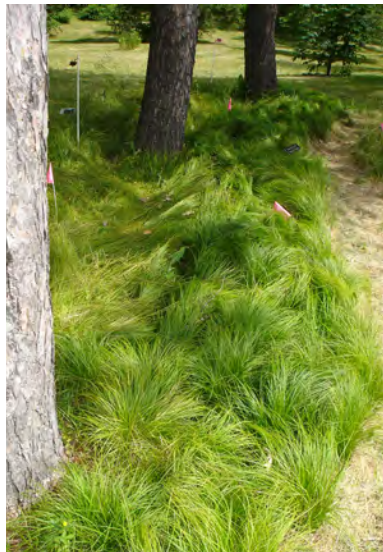
Fig. 4 Carex pensylvanica Pine