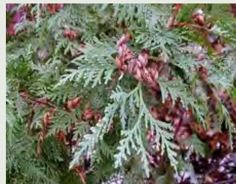
Fig. 4 Arborvitae