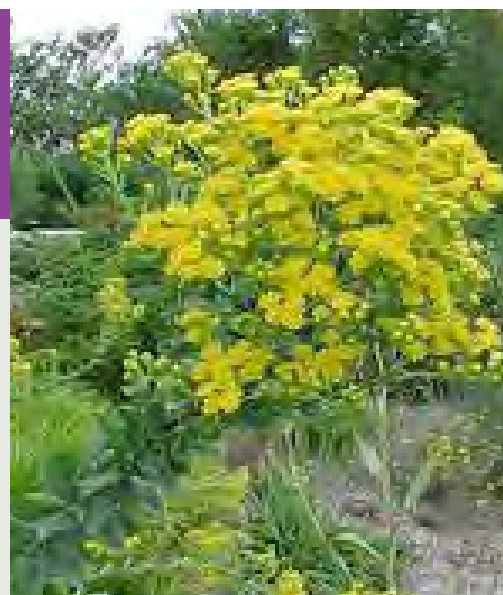
Fig. 1 Solidago

Queen bumblebees are overwintering usually in underground nests while birds need to be equipped to handle the elements. Many birds grow additional feathers and put on extra fat reserves in the fall. Their legs and feet are covered with specialized scales allowing them to control blood flow to their extremities. They can fluff their feathers, creating warm air pockets and tuck their bills/legs into their