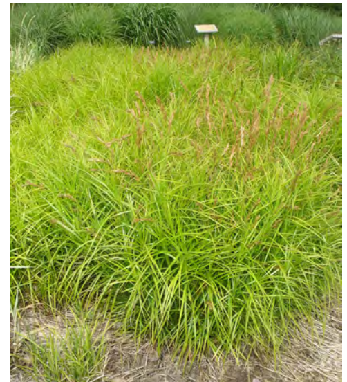
Fig. 5 Carex muskingumensis

scoparium). Blue Heaven is one type that is selected in the wild in Minnesota and propagated through tissue culture.