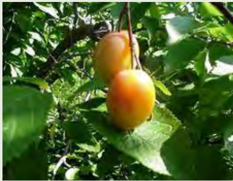
Fig. 7 Prunus