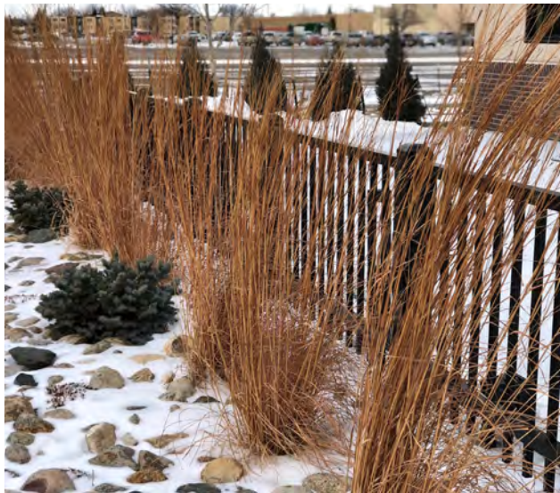
Fig. 3 Winter Big Bluestem