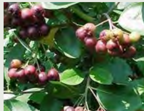
Fig. 5 Aronia