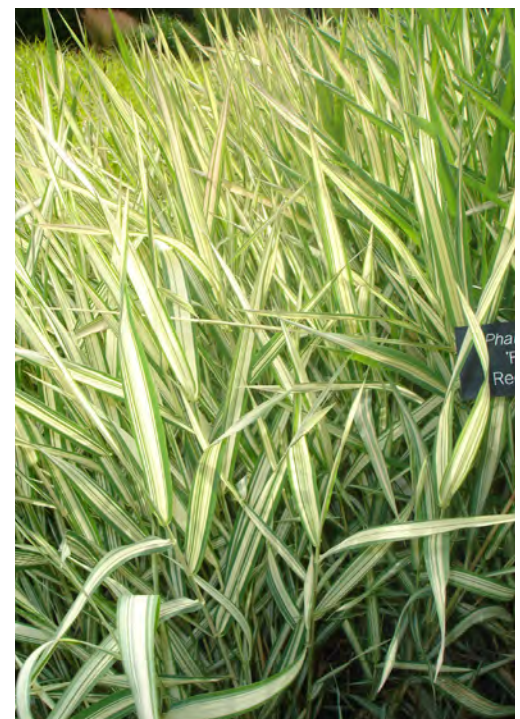
Fig. 2 Phalaris arundinacea

and the silver banner grass that did best in Zuk’s study. The latter grass is very hardy in North Dakota, but will require a gardener’s diligence to keep it in check.