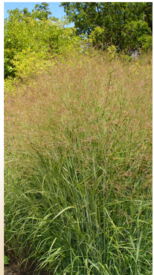
Fig. 7 Panicum

NDSU does not discriminate in its programs and activities on the basis of age, color, gender expression/identity, genetic information, marital status, national origin, participation in lawful off-campus activity, physical or mental disability, pregnancy, public assistance status, race, religion, sex, sexual orientation, spousal relationship to current employee, or veteran status, as applicable. Direct inquiries to: