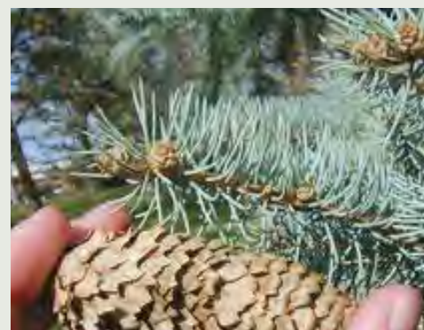
Fig. 6 Picea