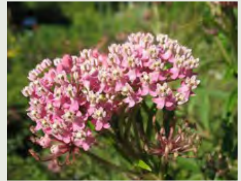
Fig. 8 Asclepias

http://www.birdsandblooms.com/birding/birding-basics/winter-birds-myths-facts/ http://www.birdsleuth.org/how-do-birds-survive-winter/ https://www.theguardian.com/lifeandstyle/gardening-blog/2015/may/12/dandelions-pollinators-wildlife-garden