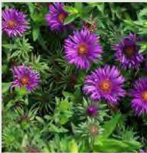
Fig. 2 Symphyotrichum

Planting a pollinator garden with a focus on native plants provides pollen and nectar during the spring and summer months. Some birds including hummingbirds need protein in the form of mosquitoes, spiders, thrips and gnats in addition to nectar so using Integrated Pest Management helps our feathered friends and the environment. Unless there is a disease problem, leave garden cleanup until spring. The seed heads are an important source of food into the winter as well as critical habitat. The Guardian urges us to "Let dandelions grow: bees, beetles and birds need them." At least delay the early spring lawn mowing. The author states, "...the dandelion's peak flowering time is from late March to May, when many bees and other pollinators emerge from hibernation. Each flower consists of up to 100 florets, individually packed with nectar and pollen. This early,