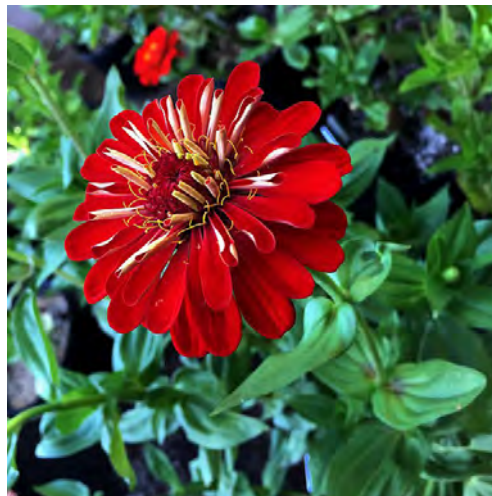
Zinnias were the most popular trial in 2017 (Photo by Don McCulley).

Cosmos varieties Double Click and Cupcake both did well in the summer's trials, though Sonata remains the top choice for cosmos