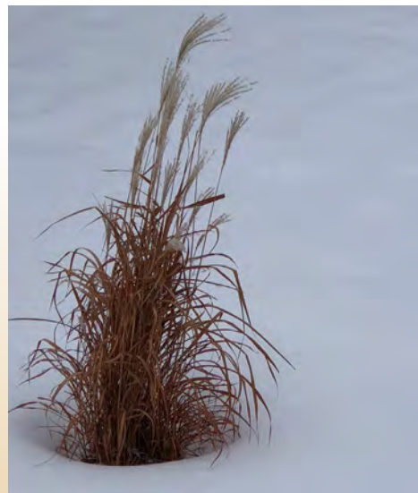
Fig. 6 Winter Flame

McGinnis, Esther, 2015, Ornamental Grasses for North Dakota, presentation to nursery growers conference.