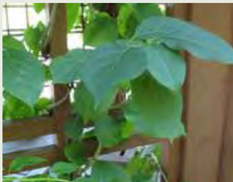
Fig. 3 Celastrus

easily available source of food is a lifesaver for pollinators in spring." Beneficial plants to consider for your garden include: