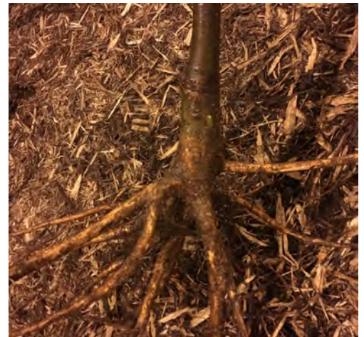
Fig 1 and 2