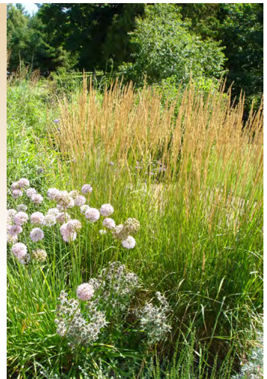
Fig. 1 Calamagrostis x acutiflora

Another consideration for landscapers: Is it well behaved or invasive? “There are some that are invasive. I’ve seen blue lyme grass take over a flower bed,” said McGinnis. Other grasses that are considered invasive include ribbon grass ( Phalaris arundinacea , Fig. 2)