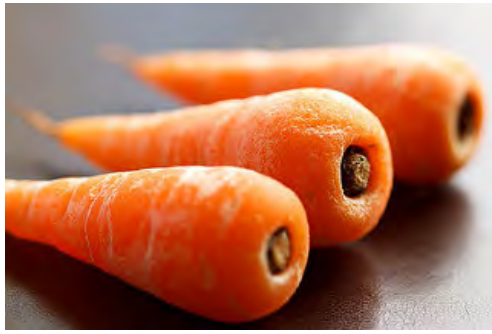
Short and stout Chantenay carrots are well suited to North Dakota's heavy soils.

out tasted the Royal Chantenay variety. Mainseason Nantes carrot varieties, Bolero and Kuroda were also popular. While the drought hindered some germination and yield levels, gardeners enjoyed growing and eating both varieties, with Kuroda having a slight advantage in raw taste.