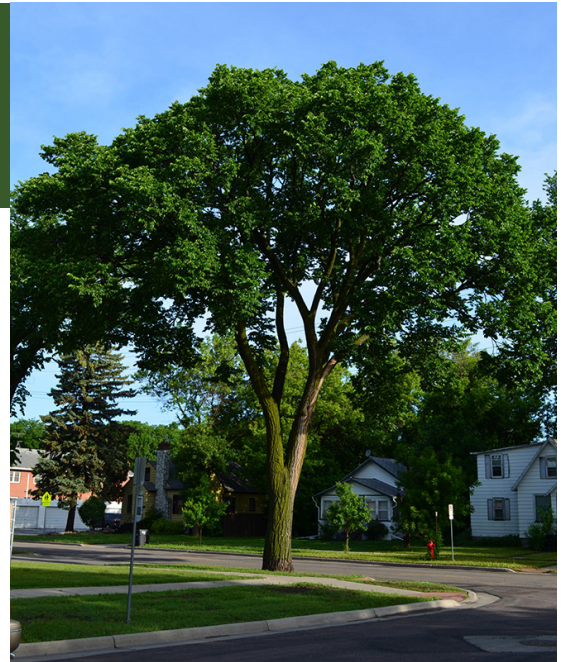
Fig. 1 2021_ElmLeaves