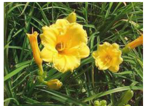
Fig 3 Daylily