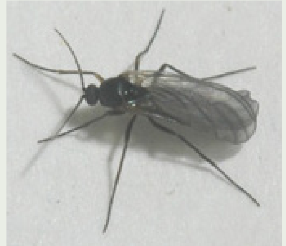
Fig. 1 Fungus gnats measure about 1/8th of an inch long and are frequently mistaken for fruit flies.

Ditto for spreading diatomaceous earth on the surface of the soil. It will break up the gnats' exoskeleton, causing them to dry out, but its effectiveness will diminish with watering, so may require