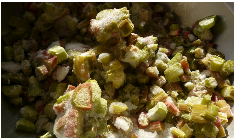
Fig. 7 Frozen rhubarb from your freezer can provide summer treats year-round.