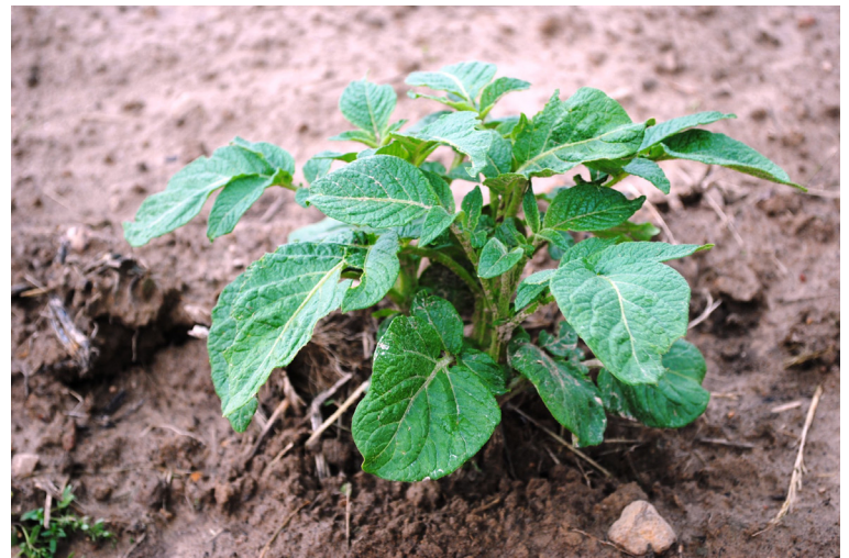
Figure 1. Potato shoots can be harmed by frost.

Fortunately, potatoes do not need to be replanted if exposed to frost. If the aboveground shoots are killed by frost, the underground tuber will produce new shoots within 10 to 14 days. However, this will delay the crop and may reduce the yield. This is why we delay planting until the emerging potato shoots have a good chance of avoiding late spring frosts.