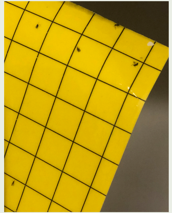
Fig. 2 Yellow sticky sheets, available in garden centers, attract and trap adult gnats. They are most effective when placed near the soil surface.

"But most of the time, they're just pests," he said.