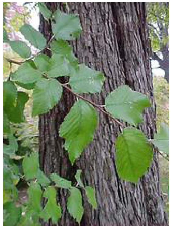
Fig. 2 2021_AmericanElmFargo