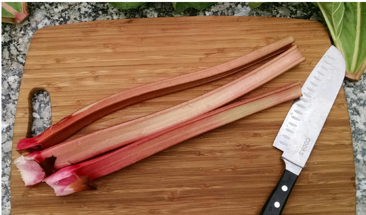
Fig. 6 Cut off the leaves entirely. "Slice the stalks - Stangen schneiden" by livewombat is licensed under CC BY-NC-SA 2.0

For planting location, soil types and varieties well suited to North Dakota, please see the NDSU Publication Asparagus and Rhubarb (H61, Revised March 2016).