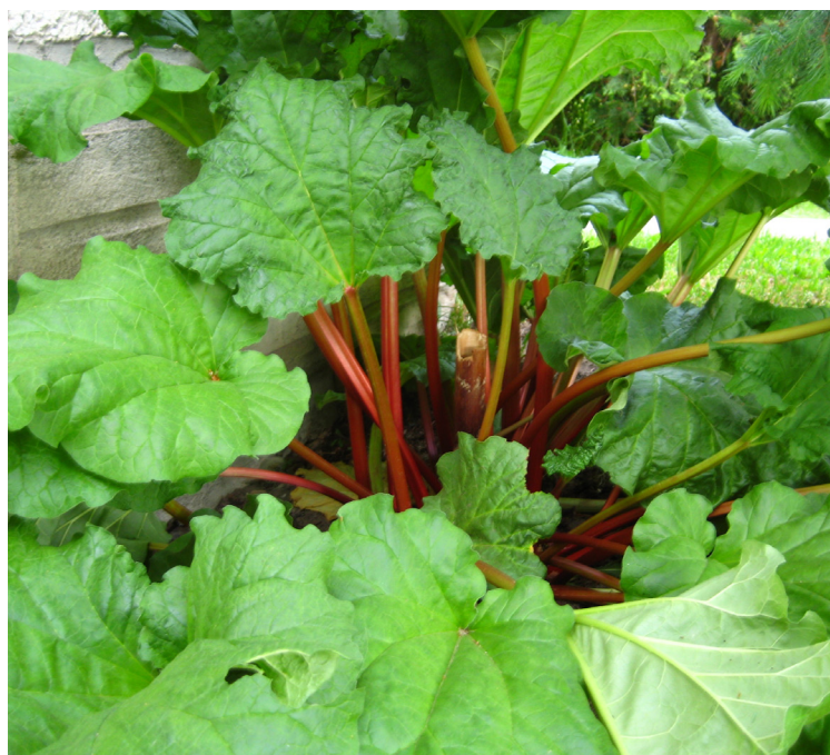
Fig. 3 Rhubarb ready for harvest. "rhubarb!" by j.lee43 is licensed under CC BY-NC 2.0

Even within the scientific community there are varying responses as to when to use or discard rhubarb that has been subjected to a frost or hard freeze. NDSU Extension takes a conservative approach: If the leaf or petiole is soft or anyway wilted, or even after a few days shows black or dying vegetation, do not use it – remove and discard. You wouldn't want to eat something that looked bad or was mushy, anyway. The plant itself underground will be unaffected, along with subsequent new growth (Fig. 3).