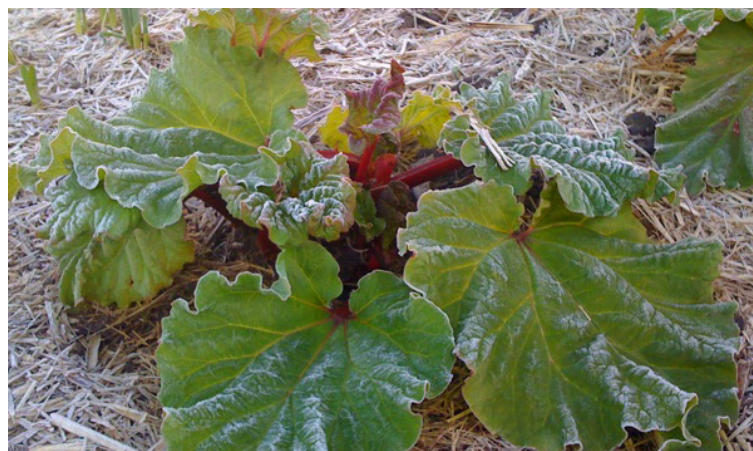
Fig. 2 "One of my poor, recently split, rhubarb plants, covered in this morning's frost #Hobart"