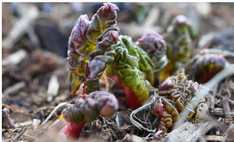
Fig. 1 New rhubarb shoots make their way through the winter mulch in mid- April.