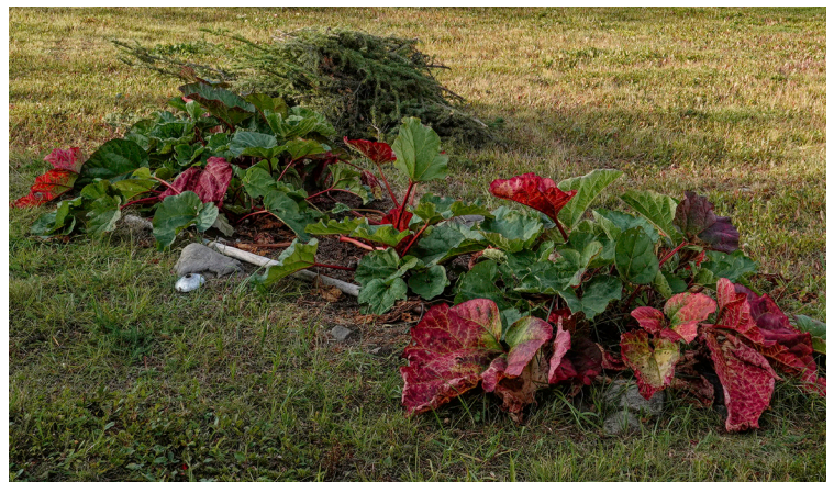
Fig. 9 At season's end, prepare your rhubarb plants for the winter ahead. "Tucking in the Rhubarb Bed" by JLS Photography - Alaska is licensed under CC BY-NC-ND 2.0

NDSU does not discriminate in its programs and activities on the basis of age, color, gender expression/identity, genetic information, marital status, national origin, participation in lawful off-campus activity, physical or mental disability, pregnancy, public assistance status, race, religion, sex, sexual orientation, spousal relationship to current employee, or veteran status, as applicable. Direct inquiries to: