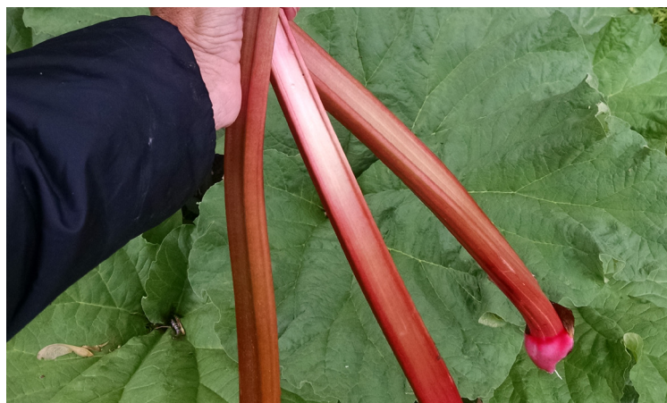
Fig. 5 "Picking rhubarb - Rhabarberstangen pflücken" by livewombat is licensed under CC BY-NC-SA 2.0