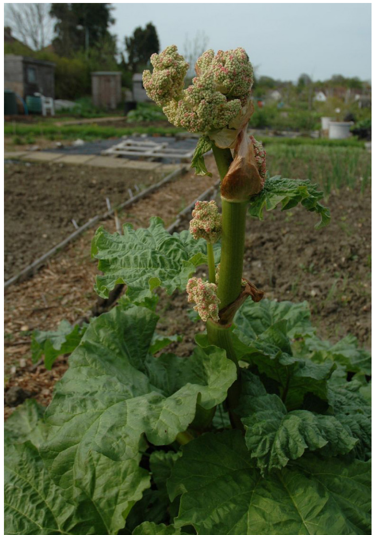
Fig. 8 The rhubarb flower stalk is very tough and should be cut off at the ground.