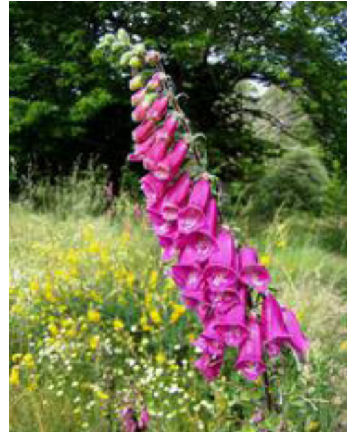
Fig 1 Foxglove

Animal Poison Control Center ASPCA Equus University of Minnesota