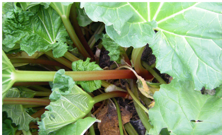
Fig. 4 Pull petioles by grasping as close to the ground as possible.