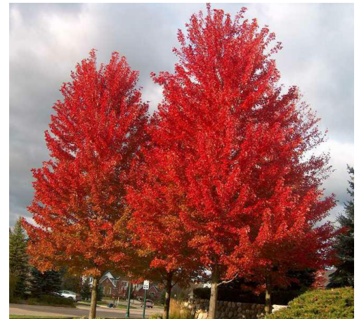
Fig 2 Red Maple