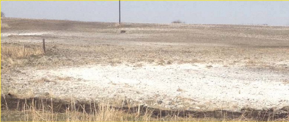
Figure 1. A typical saline spot on state Highway 17 near Edmore, N.D.

Saline soils have high enough levels of soluble salts in the soil water to negatively affect plant growth and crop yields, and even cause plant death under severe conditions (Figure 1).