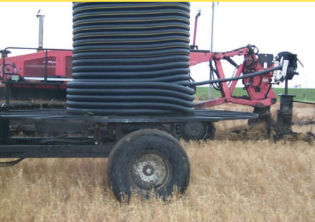
Figure 3. Installation of tile drainage in progress in Ramsey County along state Highway 17 near Edmore, N.D.