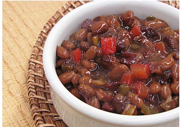
NDSU Extension Service

Makes six servings. Per serving: 150 calories, 7 g fat, 5 g protein, 16 g carbohydrate, 5 g fiber and 200 mg sodium