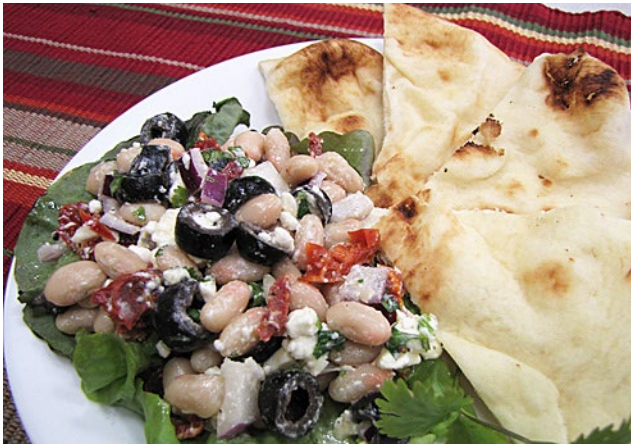
NDSU Extension Service