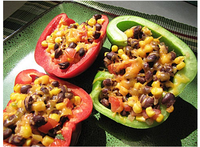
NDSU Extension Service

Makes eight servings. Per serving: 170 calories, 3 g fat, 13 g protein, 23 g carbohydrate, 7 g fiber and 300 mg sodium