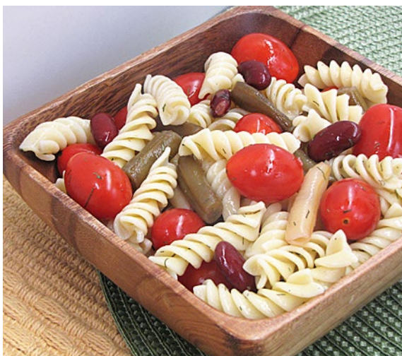
NDSU Extension Service

Makes 12 servings. Per serving: 100 calories, 1.5 g fat, 5 g protein, 19 g carbohydrate, 4 g fiber and 360 mg sodium