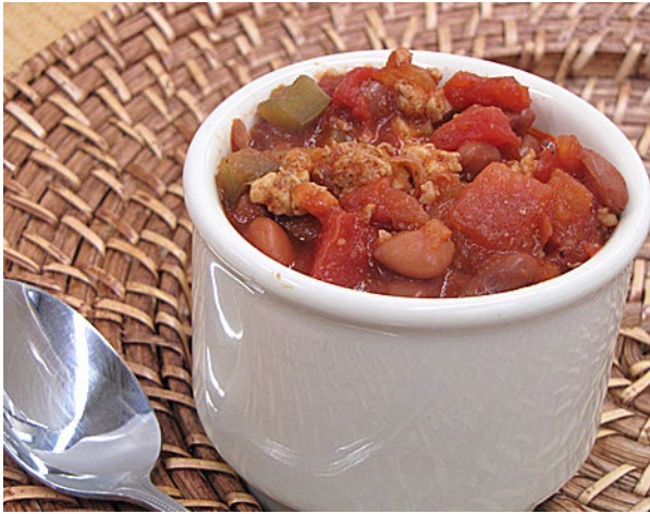
NDSU Extension Service