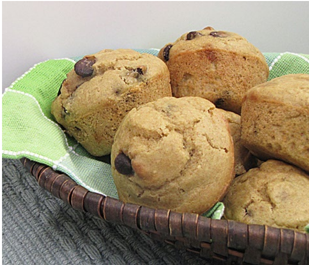
NDSU Extension Service