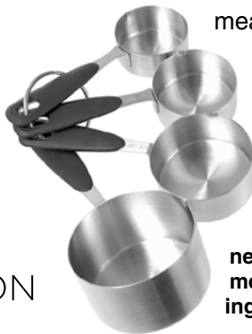
nesting cups for measuring dry ingredients

Liquid and dry ingredients are measured differently. Dry ingredients most commonly are measured in nesting cups. Liquid ingredients should be measured in clear cups with a measurement spout and measurement lines.