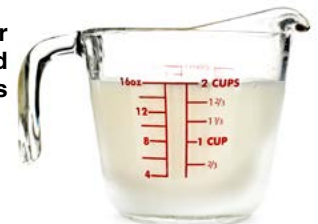
clear cup for measuring liquid ingredients