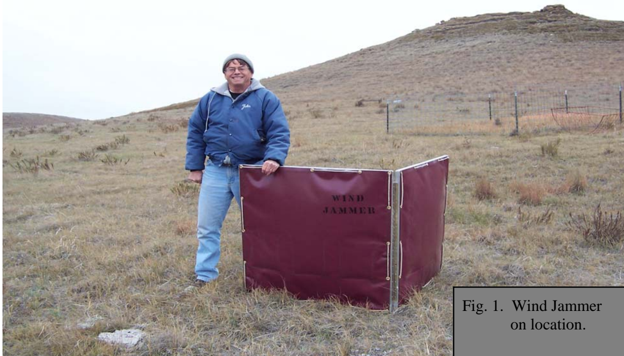
Fig. 1. Wind Jammer on location.