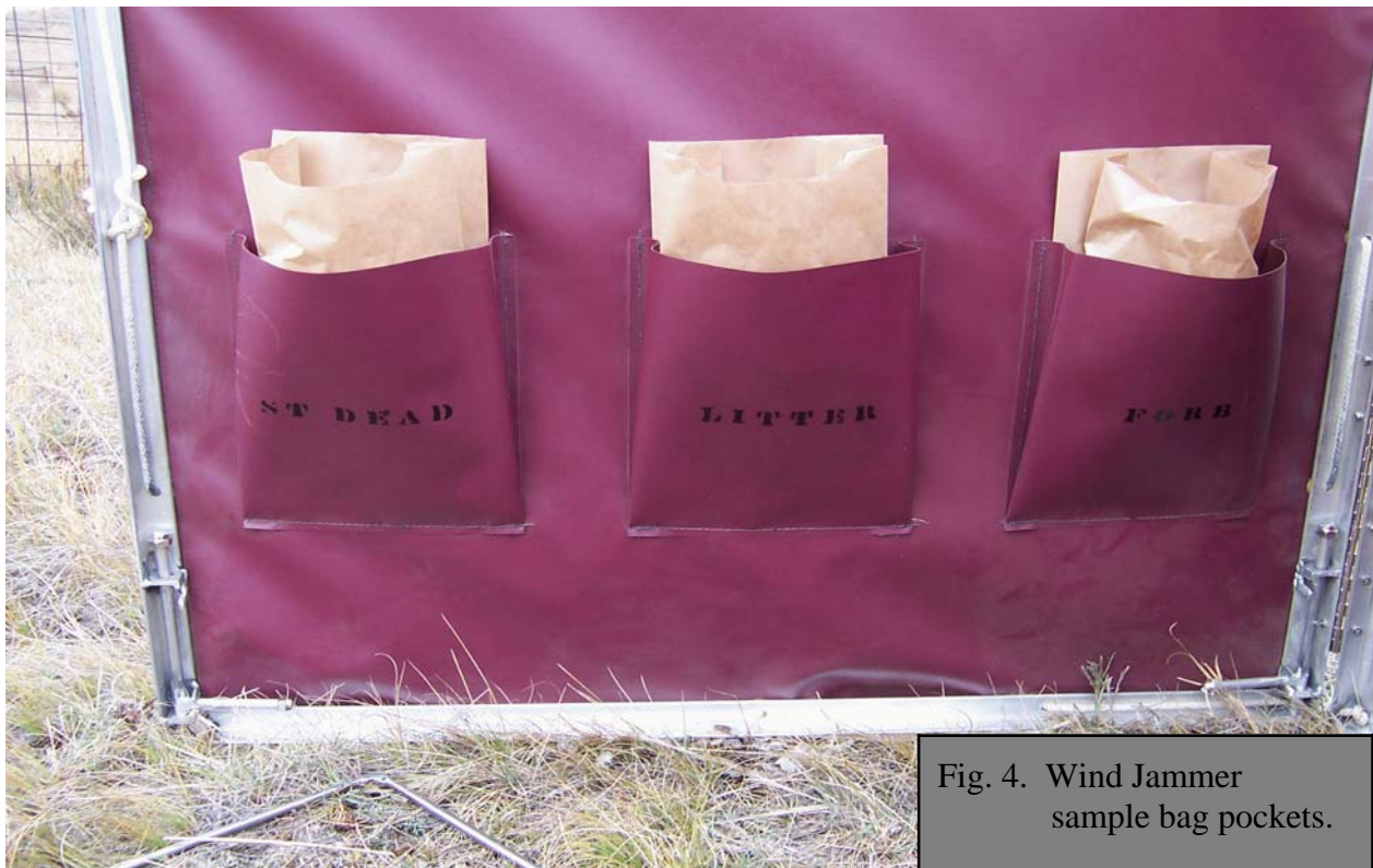
Fig. 4. Wind Jammer sample bag pockets.