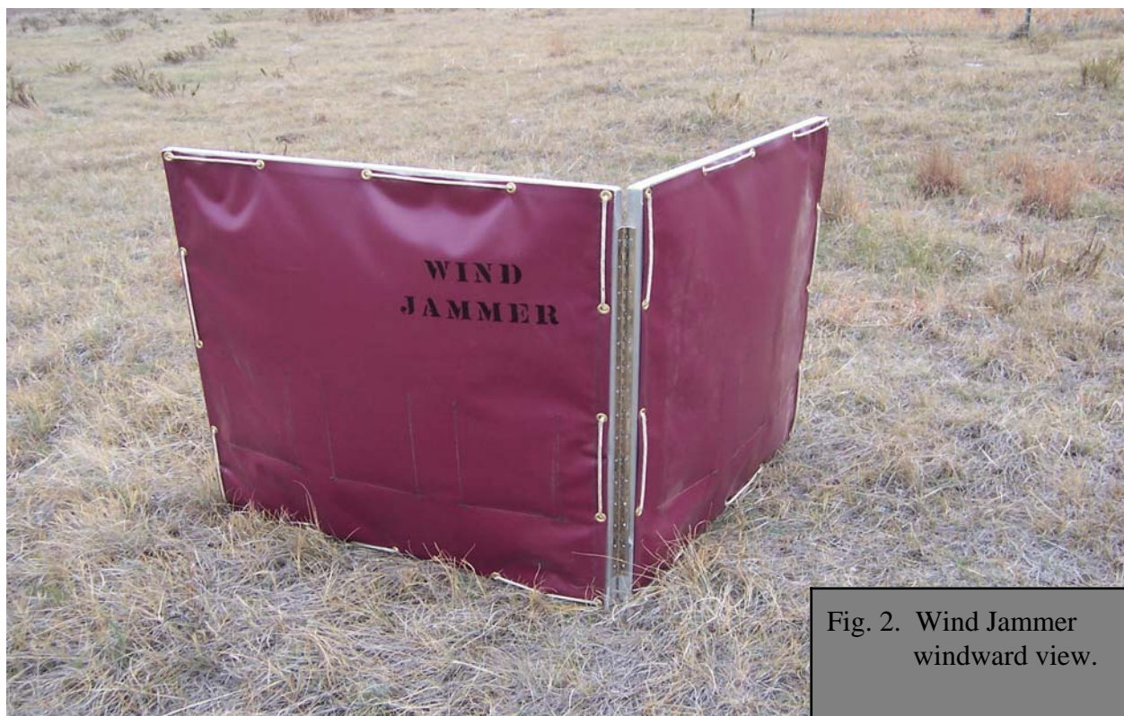
Fig. 2. Wind Jammer windward view.