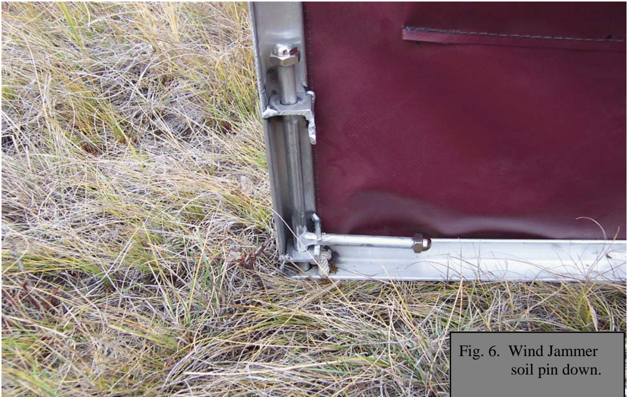
Fig. 6. Wind Jammer soil pin down.