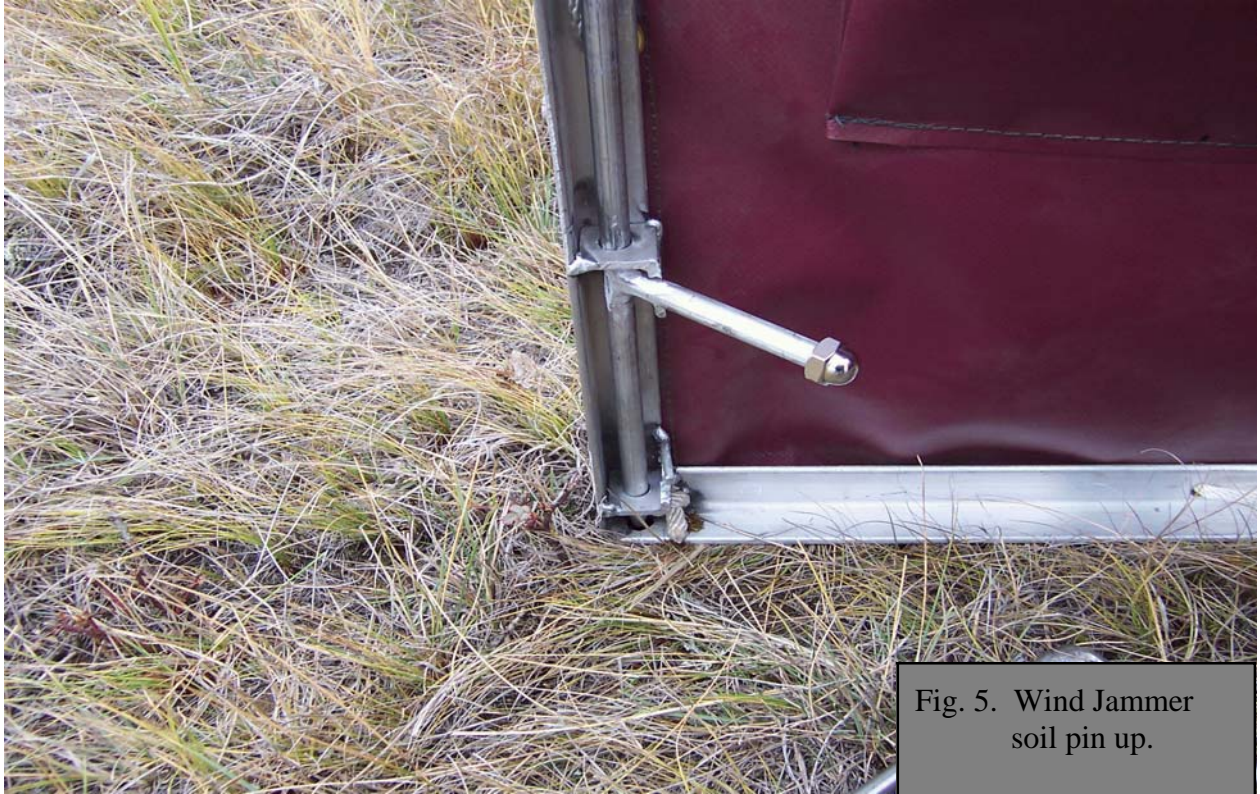
Fig. 5. Wind Jammer soil pin up.