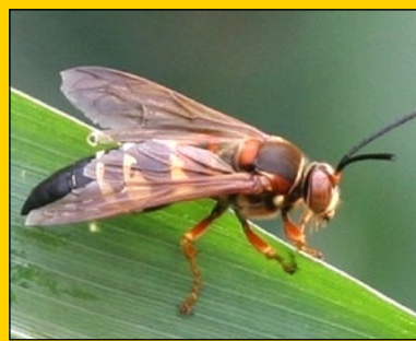
Figure 10. Cicada killer wasp.