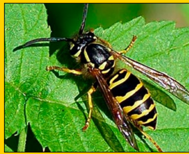
Figure 8. Eastern yellowjacket.