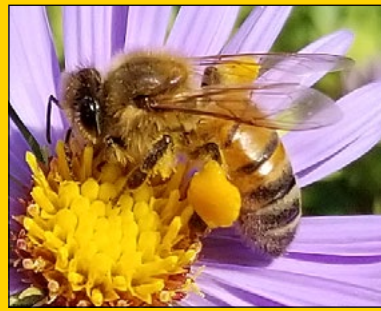
Figure 6. Honey bee collecting pollen from aster flower. Note the pollen basket on its hind legs.

As its name implies, the cicada killer preys on cicadas, and then provisions its nests with the prey as a food source for developing larvae. These wasps do not have the nest guarding instinct of other wasps and bumble bees. Although cicada killers are not aggressive, females do have stingers and can sting when threatened.