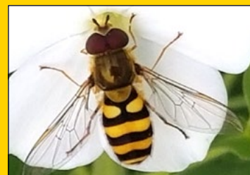
Figure 3. Hover fly. (Veronica Calles-Torrez, NDSU)