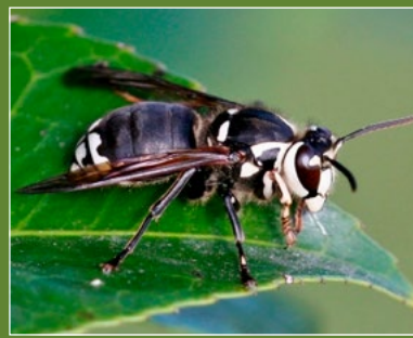
Figure 9. Bald-faced hornet.