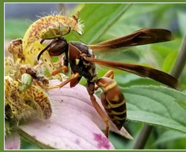
Figure 7. Paper wasp. Note the waist between the thorax and abdomen.