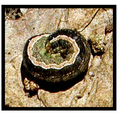
Figure 6. Larva curled into ball (a defensive behavior).

Pupation usually begins in mid- to late-August and continues through early September. Pupae overwinter in the ground at depths of 2 to 6 inches (5 to 16 cm).