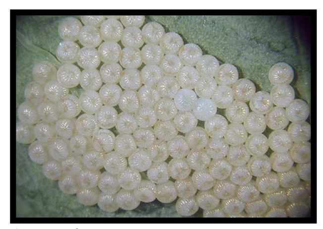
Figure 2. Bertha armyworm eggs. (Knodel, Department of Entomology, NDSU)

Pupation takes place in the soil. The pupa is a nonfeeding stage where the larva develops a protective casing around itself while it transforms to the adult stage. Pupae are typically reddish brown, podlike and about 0.2 to 0.7 inch (0.5 to 1.8 cm) long.