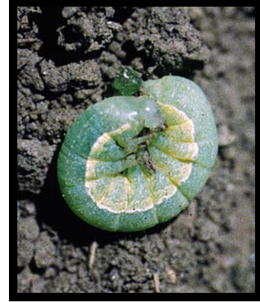
Figure 3. Green (top) and black (left) phases of mature bertha armyworm larvae.