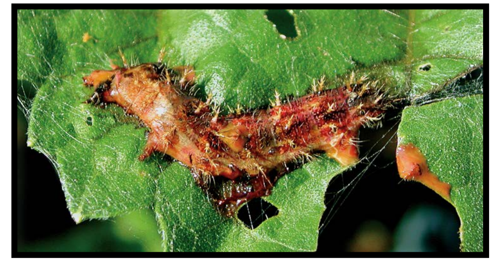
Figure 9. Example of Lepidopteran larva (thistle caterpillar) infected with nuclear polyhedrosis virus, a natural biological control agent.

One of the most successful cultural control methods is early seeding of an early maturing variety. Yield loss from bertha armyworm can be minimized if canola flowers before the peak moth flight.