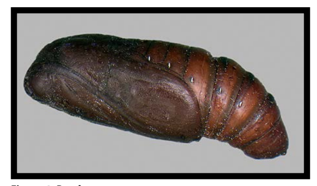
Figure 4. Bertha armyworm pupa.