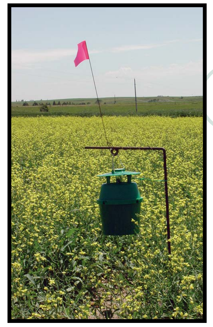
Figure 8. Sex pheromone trap used to monitor bertha armyworm. (Knodel, Department of Entomology, NDSU)

Bertha armyworm is polyphagous and is known to feed on more than 40 plant species. A variety of crops and weeds serves as host plants for bertha armyworm. Canola, rapeseed, mustard, alfalfa and related plants are the preferred host plants. Flax, peas and potatoes serve as secondary host plants. Larvae also can feed on various weed species, including wild mustard, Canada thistle, sow thistle and lambsquarters.